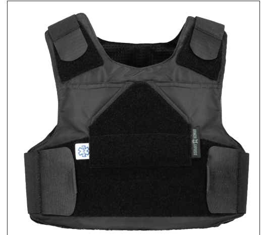
REVOLUTION TACTICAL UPGRADE